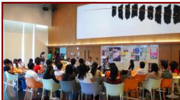
The Friends of the Arts, SRRSH.